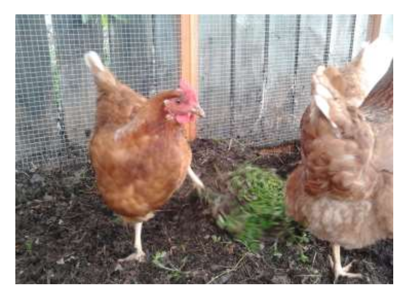
So the invite said; 'Just bring yourself and a tossed salad'?!