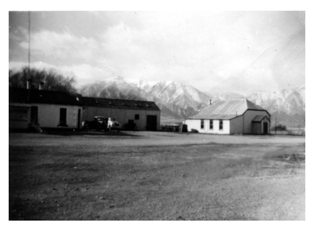
Photo: The original Omarama Hall (right) beside the Omarama Hotel prior to it being destroyed by fire.

The 1950s were the time of the Polio Epidemic, 1955/56, and the arrival of electricity to the district.